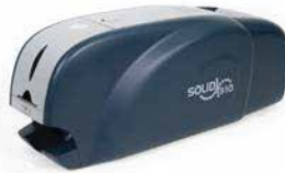
Dual sided ID CARD PRINTER SOLID-310D