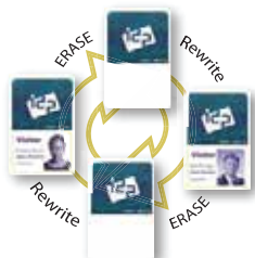
Provides a cost effective solution!

SOLID-310 Rewritable printer is an ideal solution for printing temporary information on ID cards.