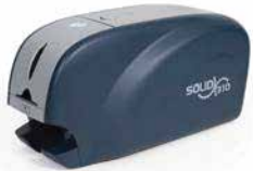
Single sided ID CARD PRINTER SOLID-310S