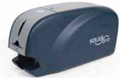
Rewritable ID CARD PRINTER SOLID-310R